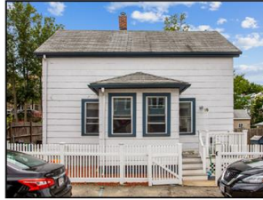
16 Woodbine Street

The HPC need to make determinations of whether the structure is to be preferably preserved and adopt findings.